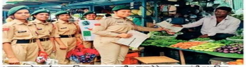
अण्णासाहेब वर्तक महाविद्यालयाच्या राष्ट्रीय छात्रसेनेच्या जवानांनी स्थानिक बाजारपेठेत कागदी पिशव्यांचे वाटप करून प्लास्टिक टाळण्याचे आवाहन केले.

छात्रसेनेच्या जवानांनी स्थानिक विक्रेते आणि स्थानिक नागरिकांना एकूण १,२०० पिशव्यांचे वितरण केले. यावेळी छात्रसेनेच्या जवानांनी स्थानिक विक्रेते आणि नागरिकांमध्ये