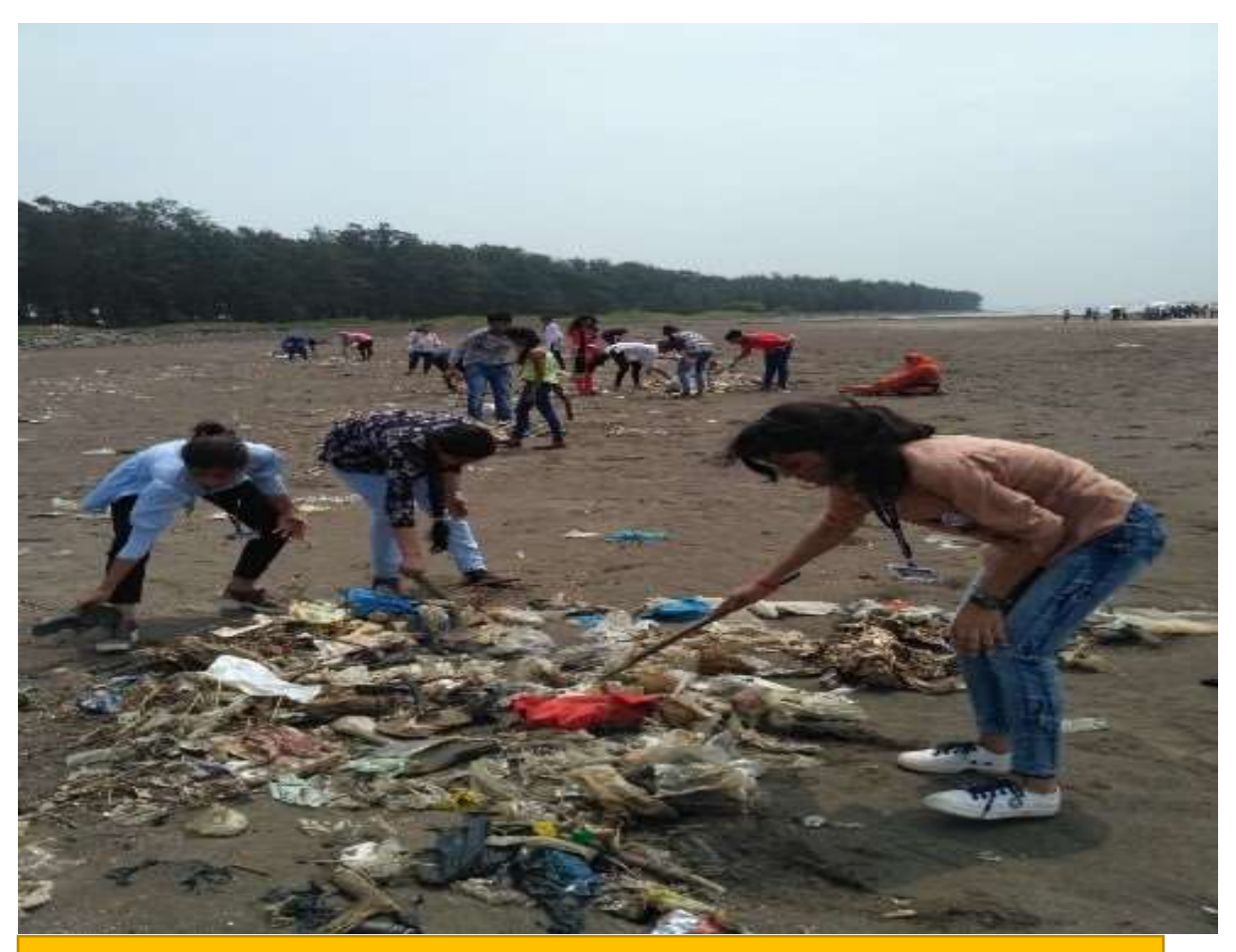
Cleanliness drive organized at Vasai Beach; it is the outreach programme to crerate environmental consciousness among the people of society.