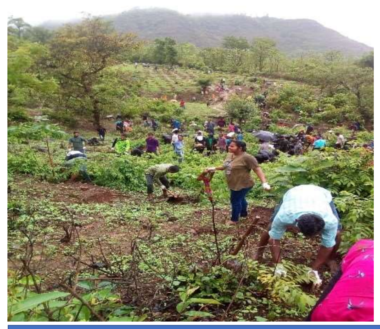
Tree Plantation drive organized at Kosbad, 100 KM from Vasai to celebrate Vanotsav , 01/07/2016